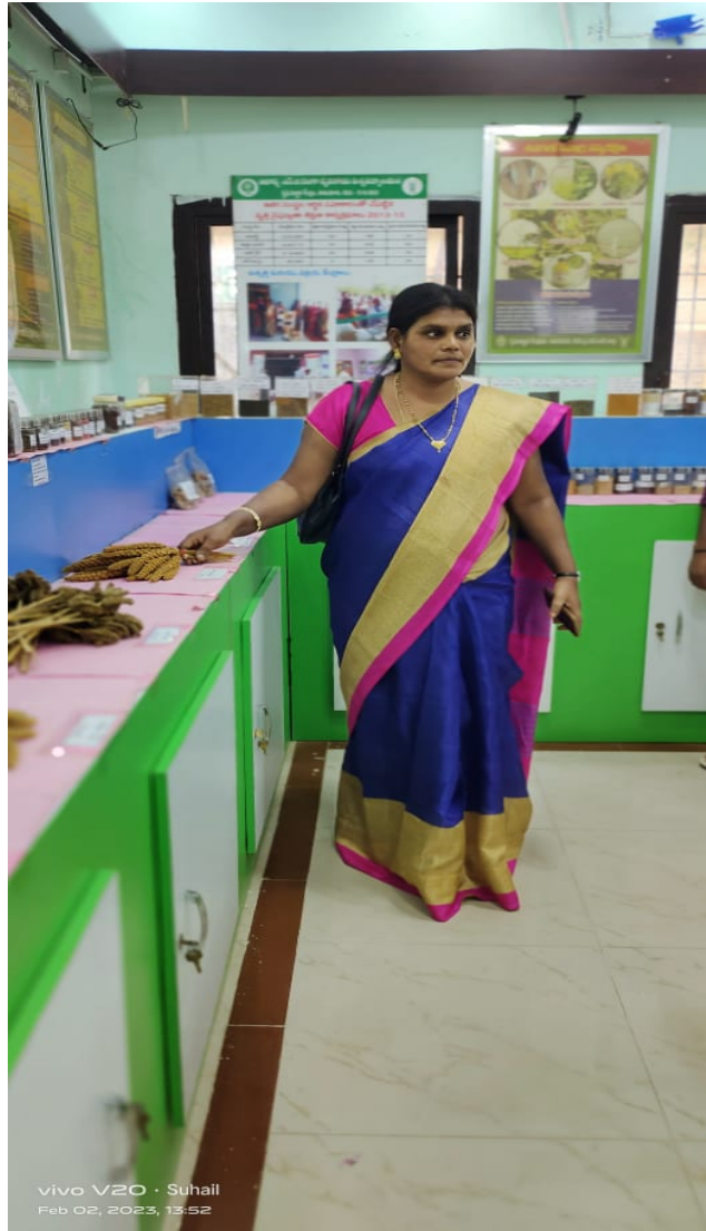
After preparation of paddy straw mushroom, we shown the formation of milky mushroom at sterilization chamber and also natural resource crops are observed in exhibition museum.